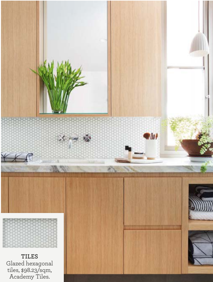
TILES Glazed hexagonal tiles, $98.23/sqm, Academy Tiles.