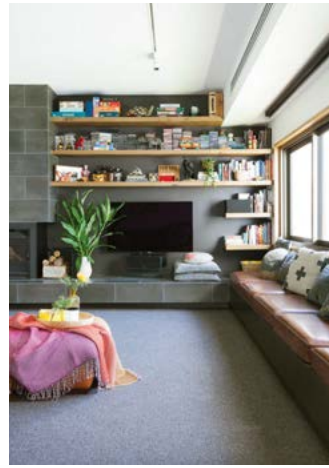
ENSUITE Understated, yet undeniably luxe, the ensuite (left) features a soothing, organic palette of Laminex 'Tasmanian Oak Wave' timber veneer, used on the cabinetry, and the same 'Manhattan Grey' marble from Corsi & Nicolai that appears in the kitchen. White hexagonal mosaics, paired with a pale grey grout, line the splashback, while a delicate 'Eido' pendant from Porcelain Bear adds a lovely finishing touch.